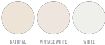
NATURAL VINTAGE WHITE WHITE