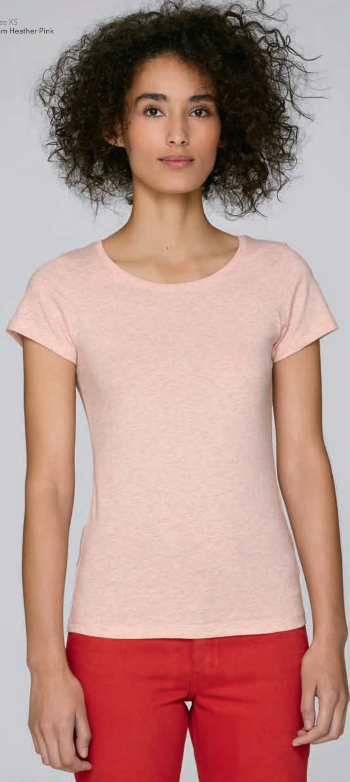
Giulia is 1,76 m - Size XS Stella Wants - Cream Heather Pink